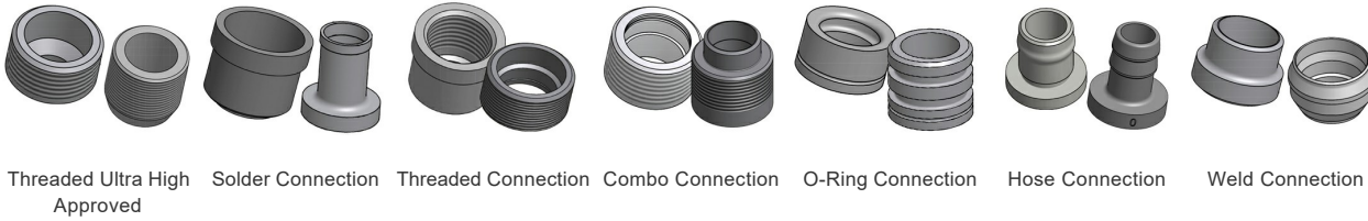
Threaded Ultra High Approved Solder Connection Threaded Connection Combo Connection O-Ring Connection Hose Connection Weld Connection

*For specific dimensions, or information about other types of connections, please contact your SWEP sales representative.