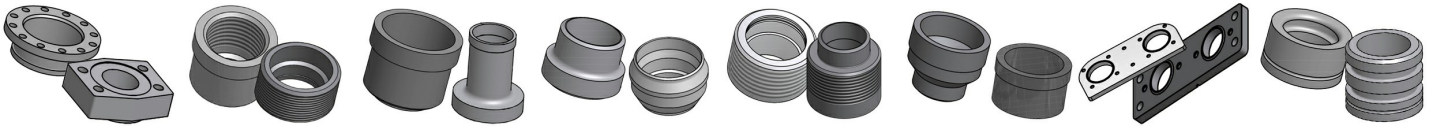
Flange Connection Threaded Connection Solder Connection Weld Connection Combo Connection Victaulic Connection Connection Plate O-Ring Connection

*For specific dimensions, or information about other types of connections, please contact your SWEP sales representative.